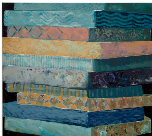
Ten Siblings, 2021