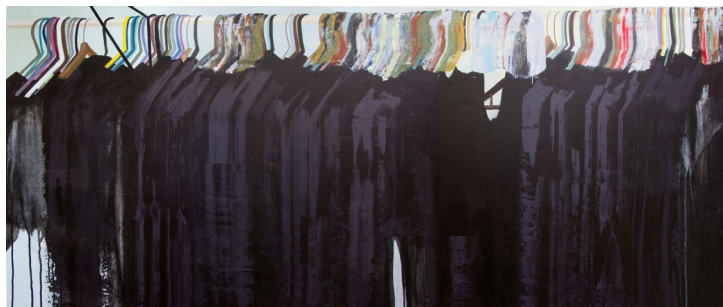
Every Day is Ashura II, 2020