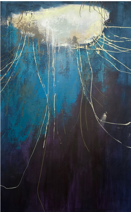
Jellyfish , 2022