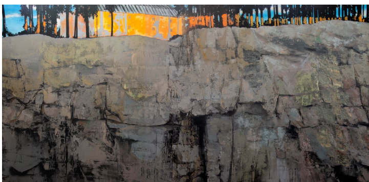
Refugee Camp , 2022 Mixed media on linen 290 x 590 cm