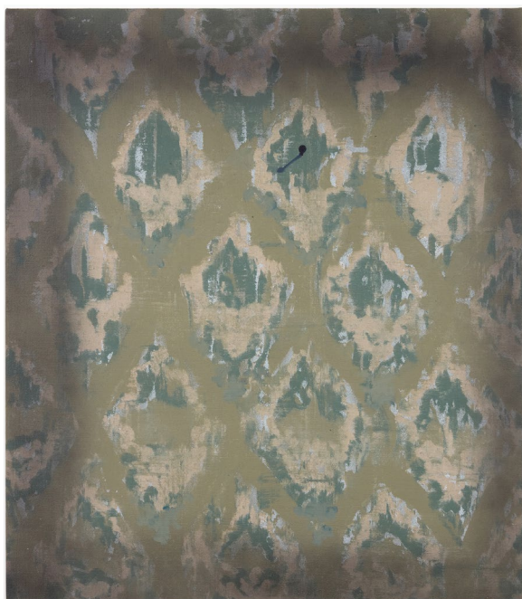
Weeping Walls III , 2022 Mixed media on linen 75.5 x 65 cm