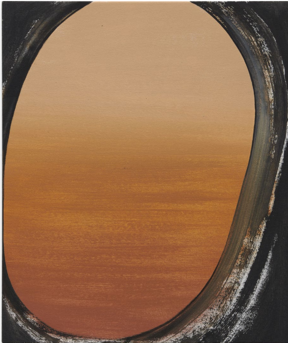
The Point 0 , 2020