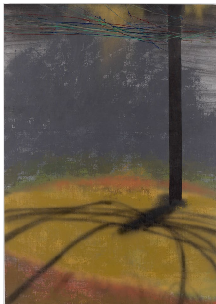
Electric Issues, 2022