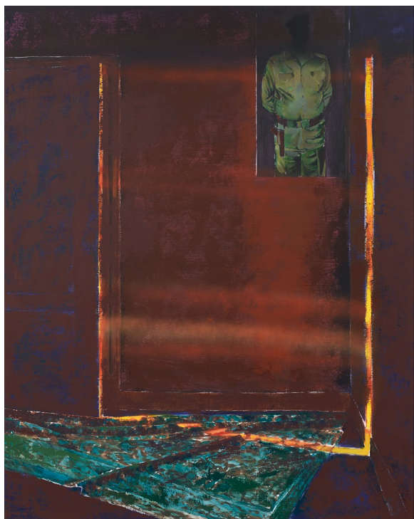
Meditation Room , 2022 Mixed media on linen 280 x 230 cm Courtesy of the artist and Modern Art, London