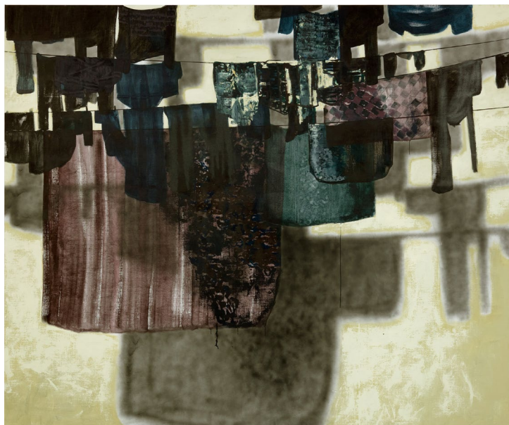
The Weeping Lines , 2022 Mixed media on linen 291 x 343 cm